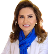
Rozanne 'Twinkle' Cocon-Gamboa Governor, District 3860 Zone 3D