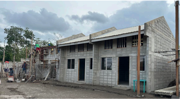
Two housing units at Friendly Homes in the RCDS adopted community ready to be inaugurated on Friday, June 28 by DG Twinkle Gamboa.